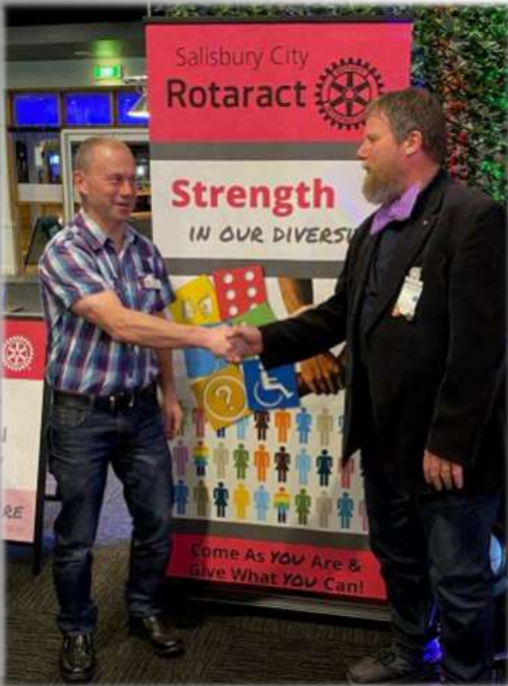
Salisbury City Rotaract Club Changeover.