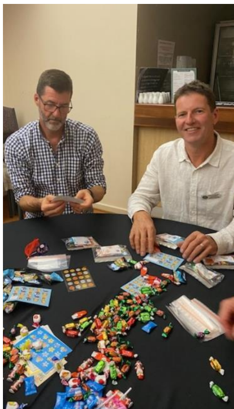
Below: LOLLY BAGS FOR GIVING AWAY FROM GAWLER LIGHT'S PAGEANT FLOAT