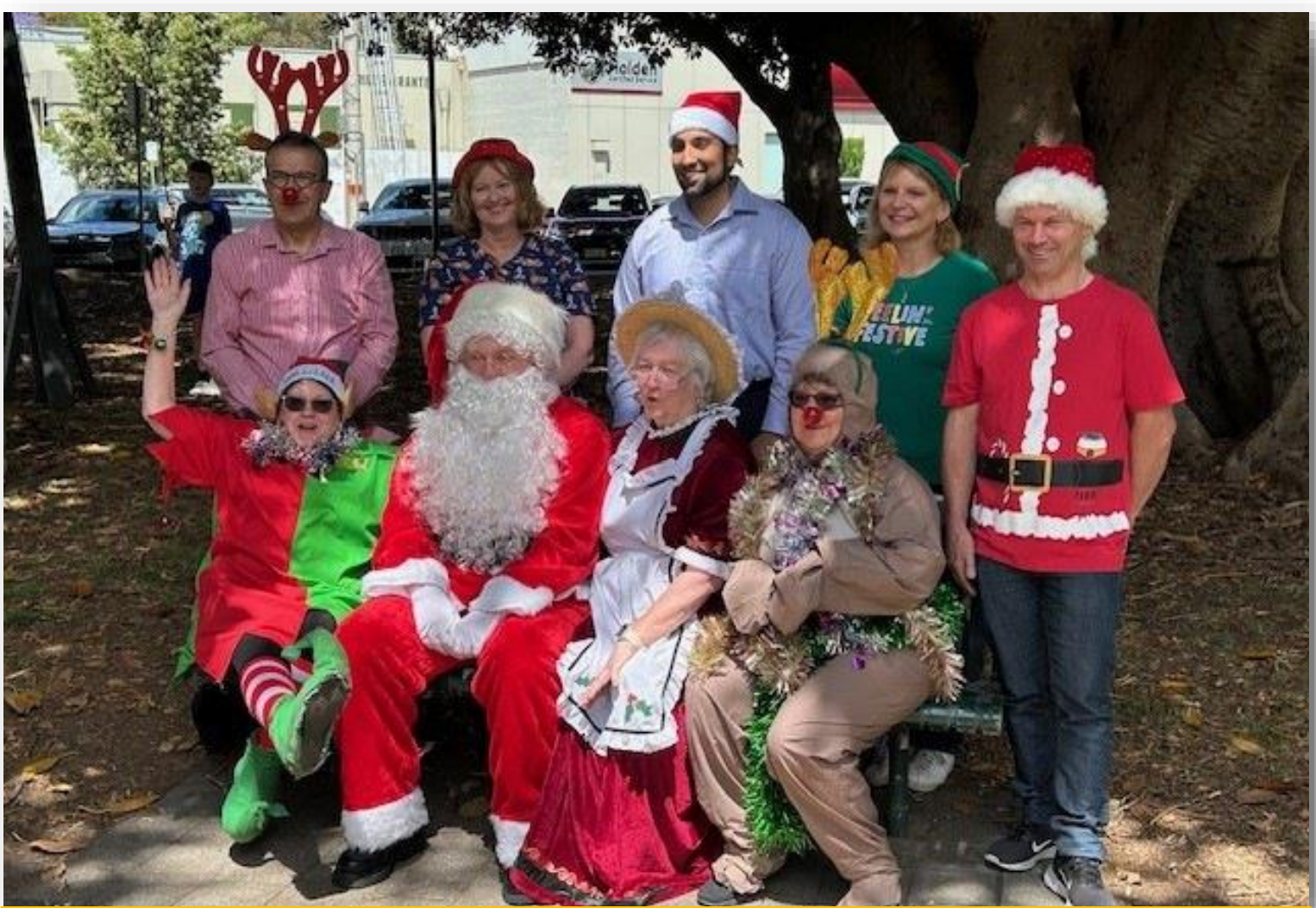
Above: TOWN OF GAWLER BRINGING THE COMMUNITY TOGETHER FOR THE VILLAWOOD CHRISTMAS PAGEANT