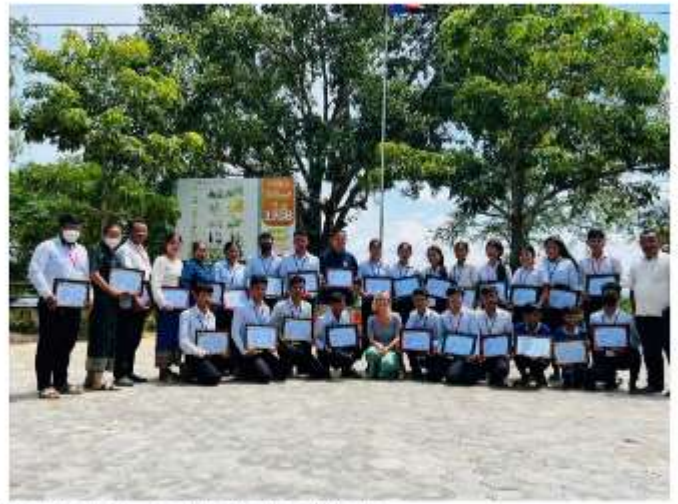
Participants of the Entrepreneurship training program receive their certificates.