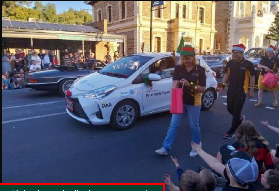
Rotary Club of Gawler Light dynamically demonstrates its community commitment during the Christmas Pageant