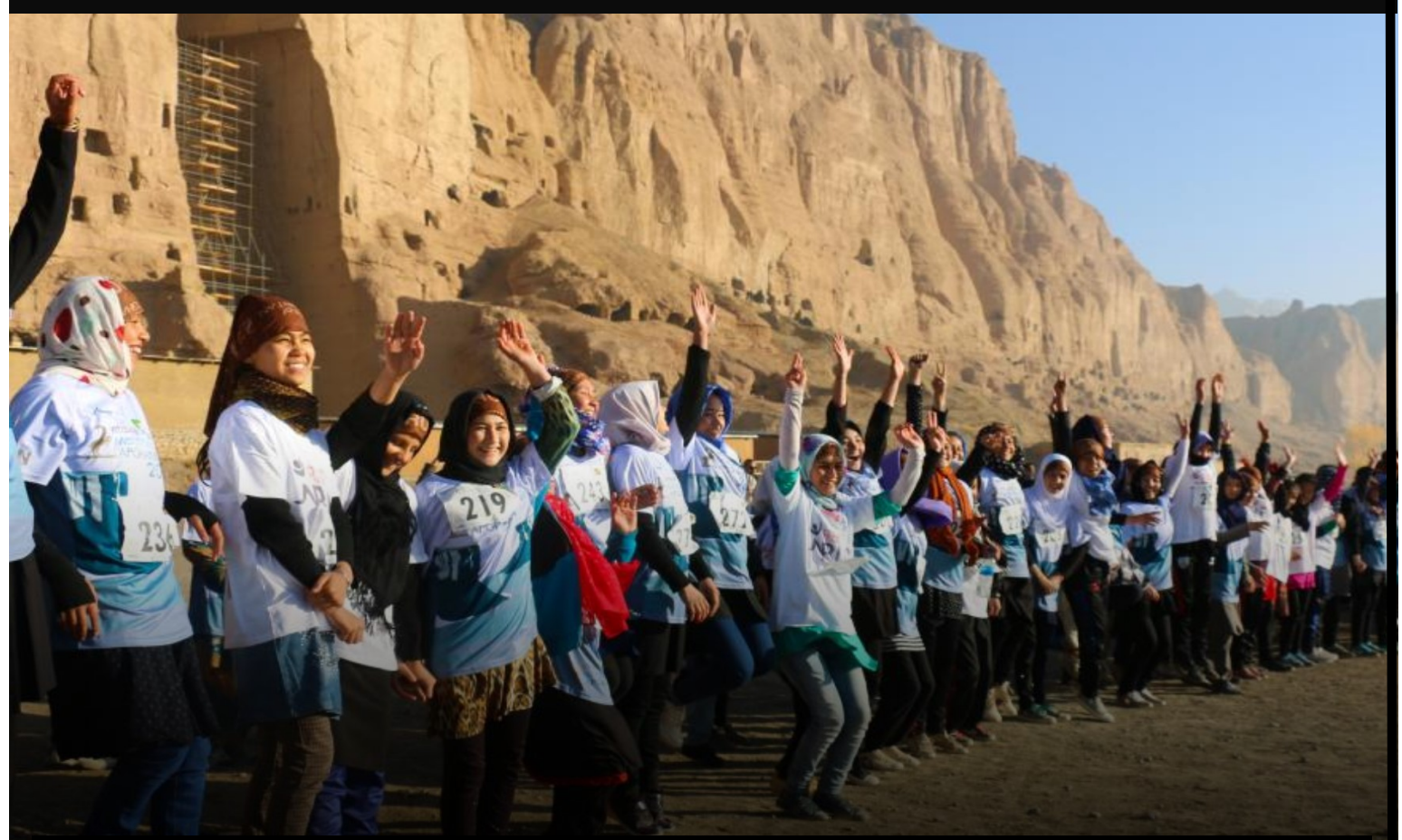
The Afghan women who were determined to run—Hope overflowing restores & reinvigerates

The theme was inspired and detailed with a story of hope following the tsunami in southeast Asia when he was given a small conch shell by a survivor who had lost her family, home and livelihood. The efforts of Rotarians had restored her optimism and given her hope.