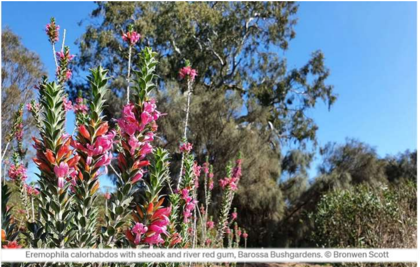
Eremophila calorhabdos with sheoak and river red gum, Barossa Bushgardens.

At the heart of the Barossa Bush Gardens is a 400-year-old river red gum. In its shade grow purple coral pea, wattle and hop bush. Its branches are loud with parrots and honeyeaters. Paths curve away from it to meander for about 2 kilometres through flower beds and blue gum woodland.