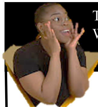
Thought for the Week